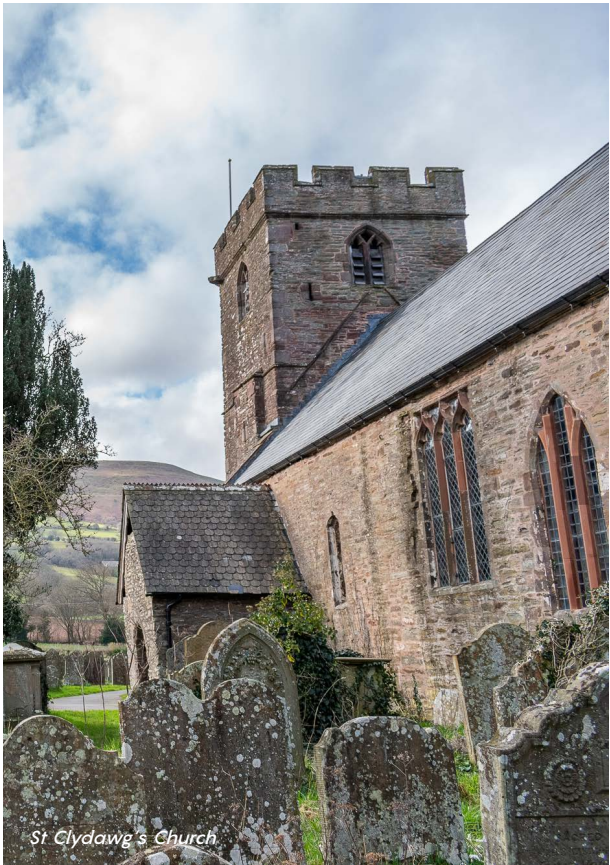
St Clydawg's Church